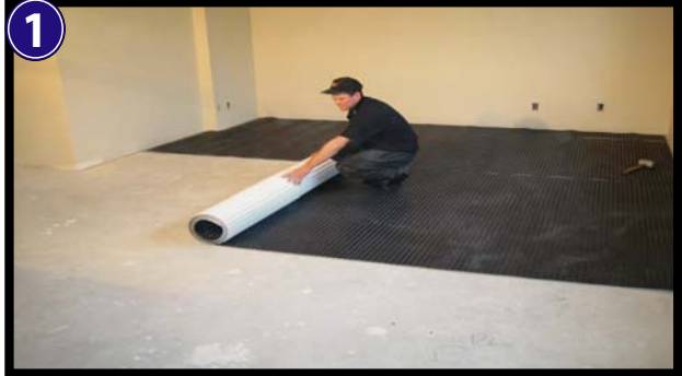
1 Unroll Warm N Quiet Subfloor™ and cut to fit. Leave a 3/8" gap around walls stairs and supports