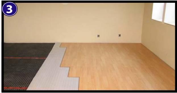
3 Install flooring in opposite direction of membrane seams to manufacturers specifications

This brochure is only a guide and is not intended to be an installation instruction. For detailed instructions refer to roll label or go to www.superseal.ca