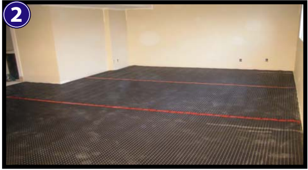
2 Butt edges together and tape seams with vapor barrier tape