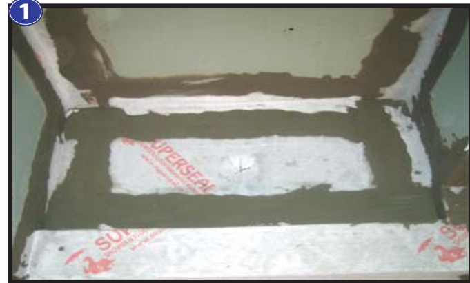
Apply thinset to main areas