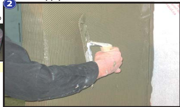
Apply membrane, smooth out with trowel